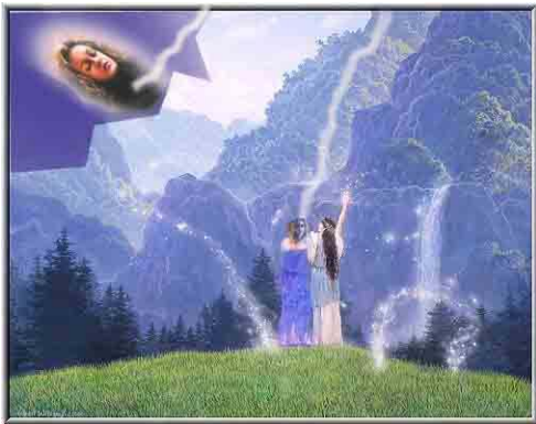
Illustration left: meeting with the spirit- guide or for example a so-called dead mother on the astral level while the physical body sleeps, as shown by the unbroken "silver-cord" to the coerced body.

"You are not my mother?" I said, half by way of assertion, half in inquiry.